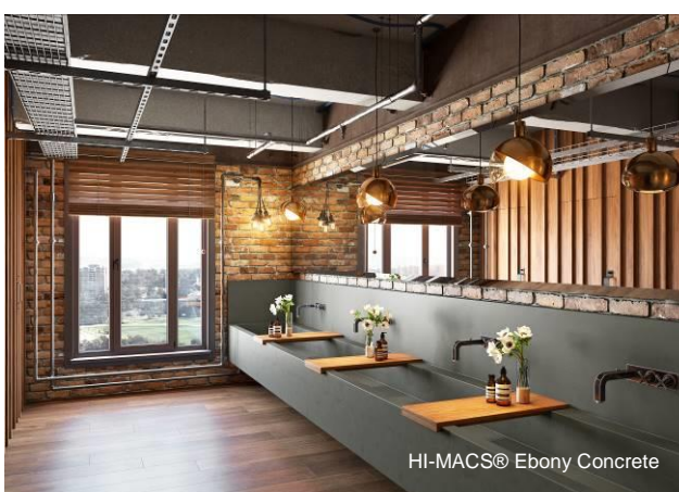
HI-MACS® Ebony Concrete