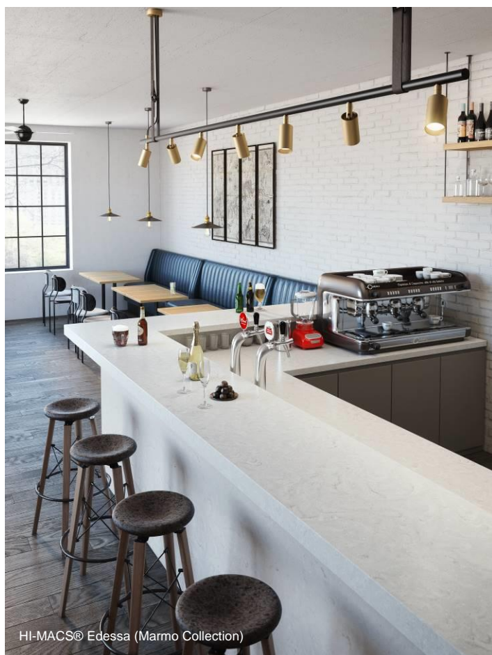
HI-MACS® Edessa (Marmo Collection)

The HI-MACS® Marmo Collection has been updated with nine new colours to fulfil current trends for top-quality marble looks, ranging from pale white-in-white, through shades of grey, to striking dark-brown and anthracite tones. The new tones, born from the latest generation of Marmo Solid Surface production technology, display a surface with short and sharp veining, for a more realistic look and easier seamless fabrication.