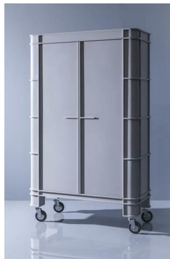
Grey on Gray by Visser & Meijwaard