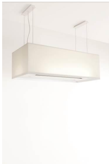
Zen Hood by Novy

Finally, for Dutch Satellite, the studio Lotte Douwens created "Table Landscapes", a system of trays designed to overlap and criss-cross on the table, creating a muddle of colourful and dynamic surfaces.