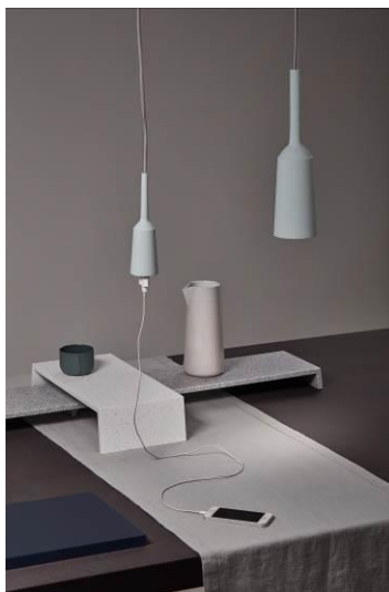
Landscape Tables by Lotte Douwens