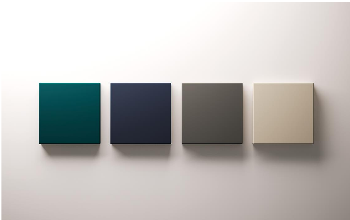
New colours: Evergreen, Cosmic Blue, Mink & Suede